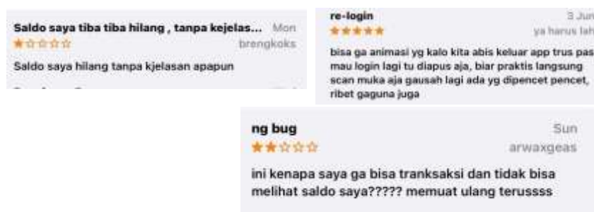
Figure 1 Customer Complaints Livin' by Mandiri

years ago. Livin' by Mandiri, it is expected to become a super app that is able to meet every customer's needs in accessing financial services such as opening savings, credit cards, opening deposits and loans, and others with just one application. Since its launch, Livin' by Mandiri has become a mobile banking application that has experienced positive growth, where Livin' by Mandiri users has increased since 2019 until now. Bank Mandiri's mobile banking service, Livin' by Mandiri, is declared to still be the banking application that the company relies on (Kontan.co.id, 2022).